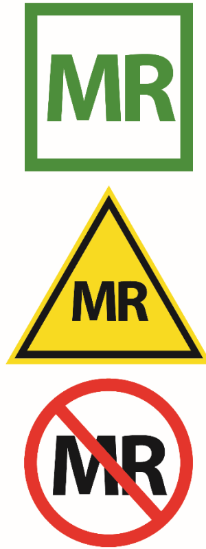
Figure 1. FDA labeling criteria developed by ASTM International 8 for portable objects taken into Zone IV. The square green MR Safe label is for nonmetallic, nonconducting objects; the triangular yellow label is for objects with MR Conditional labeling; and the round red label is for MR Unsafe objects.

MR Safe: A designation indicating that the object or device is safe in all MR environments, without conditions. It is reserved for nonmetallic, nonconducting, and nonmagnetic objects that pose no known hazards in any MR environment.