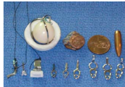
Sample of various objects tested