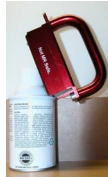
Items were considered ferrous if attracted to a test magnet