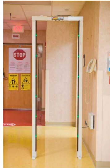
FerrAlert™ Halo Prescreen ferromagnetic detector http://www.koppdevelopment.com/prescreen.html