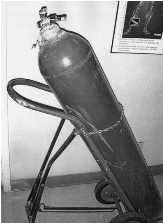
Figure 2. The size "H" oxygen cylinder after the regulator was sheared off. Note the scrapes on the cylinder and the bent beam on the cart.